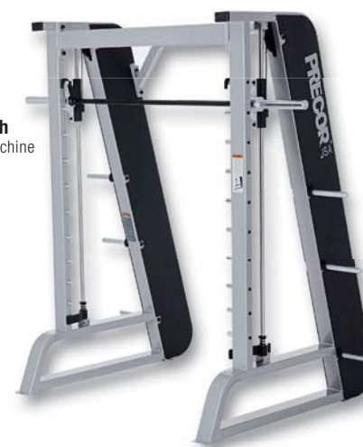
Strength Smith Machine 802