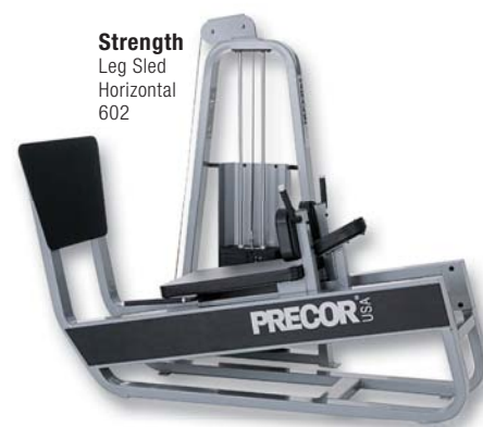
Strength Leg Sled Horizontal 602