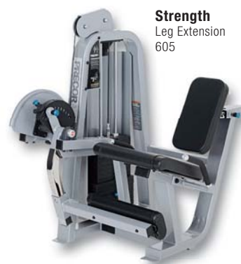
Strength Leg Extension 605