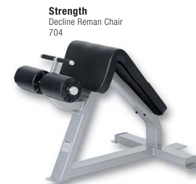
Strength Decline Roman Chair 704