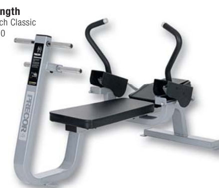
Strength Abench Classic AB100